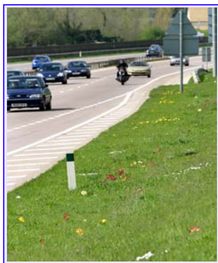
Garden Polyanthus are out of place on this Cotswold road verge – a region where the native Cowslip is a characteristic wild flower. The wrong plants are often used because they are not obtained from a specialist grower of native flora. Many nurseries will also substitute what was ordered for what they have in stock.

Seed could be propagated to produce plug plants (or plugs can be purchased) and subsequently planted into treated areas of open ground where the plants will not be swamped by surrounding grass.