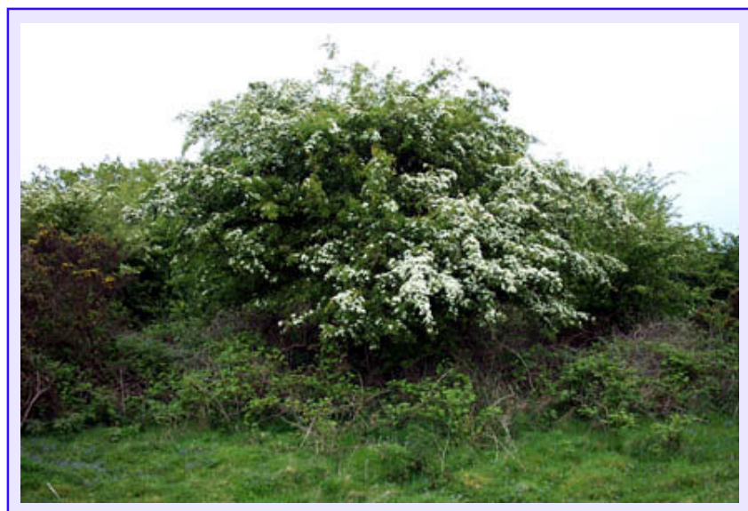
Native shrubs, such as Hawthorn ( Crataegus monogyna ), are attractive in spring and produce berries for birds in the autumn.