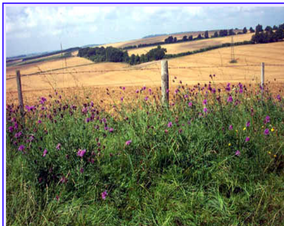
Road verges that support native wild flowers, such as this chalk grassland verge, should be managed by mowing. This will help to restore and maintain their native flora. Planting trees, daffodil bulbs or other flowers (cultivated or native) would be inappropriate here.

Check for the use of the site by protected species such as Badger and Great Crested Newt. (It is an offence, without a licence, to disturb the habitats of these species, to relocate, kill or injure them.)